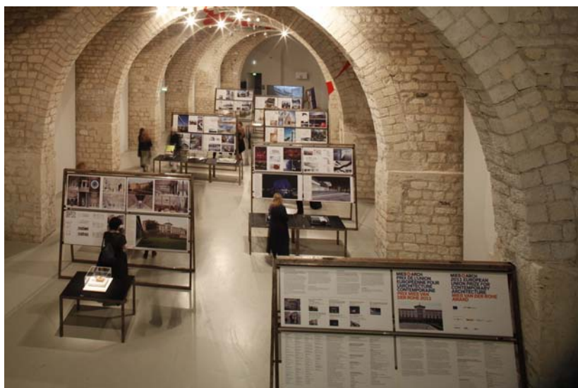
Exhibition, 2011 Prize, Cite de l'architecture & du patrimoine/Institut français de l'architecture