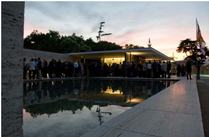
Granting ceremony, 2011 Prize

In addition to the Prize and Special Mention, the jury makes a selection of shortlisted works to be published in a catalogue and included in a travelling exhibition. This broad selection allows each edition of the Prize to take on the role of a biennial anthology that documents the evolution of European architecture, as well as provides an important archive that includes photographs, original drawings, digital material and models.